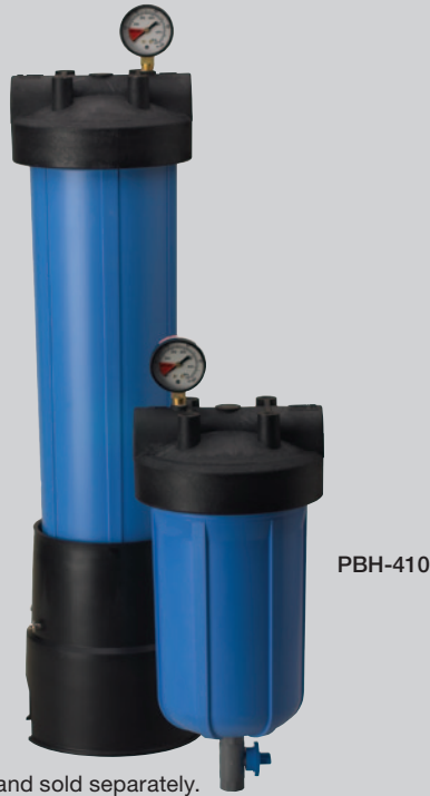
PBH-420 (Shown with bag vessel stand)*